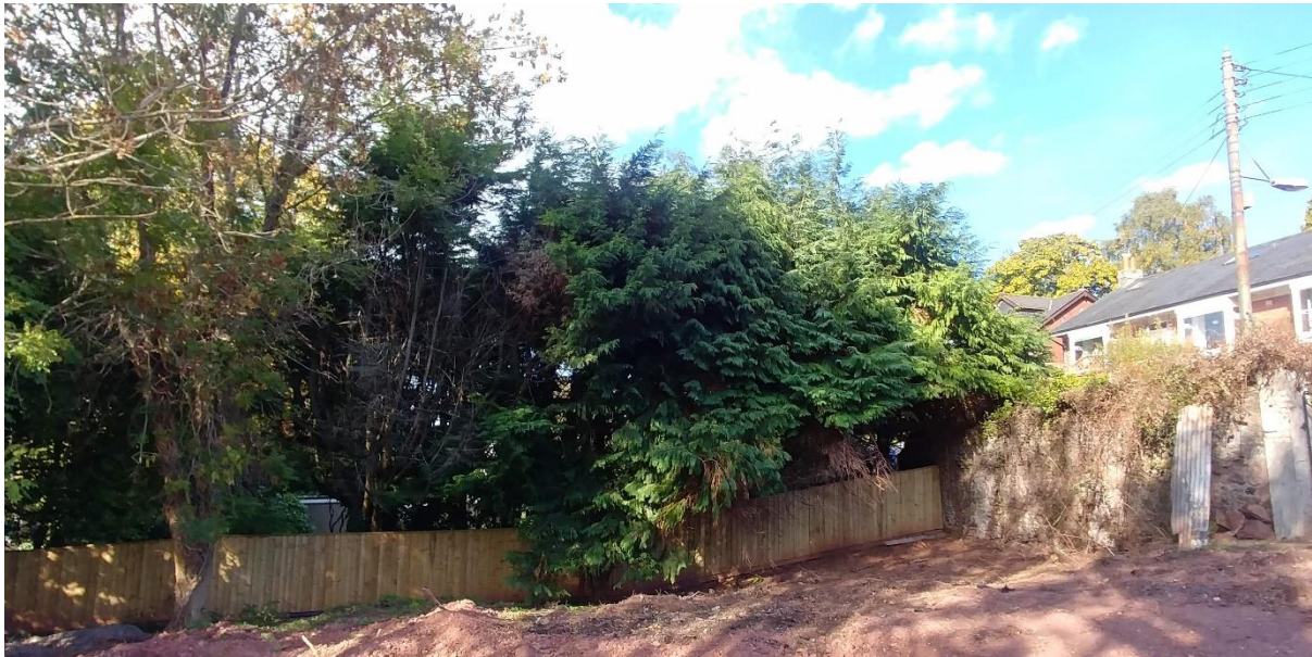
Figure 4 - H1 Leylandii - not a tree and does not fall within the scope of the TPO.

I would request that this evidence is presented to the deciding committee.