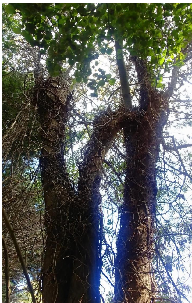
Figure 3 Tree 7 previously topped with limited viability.