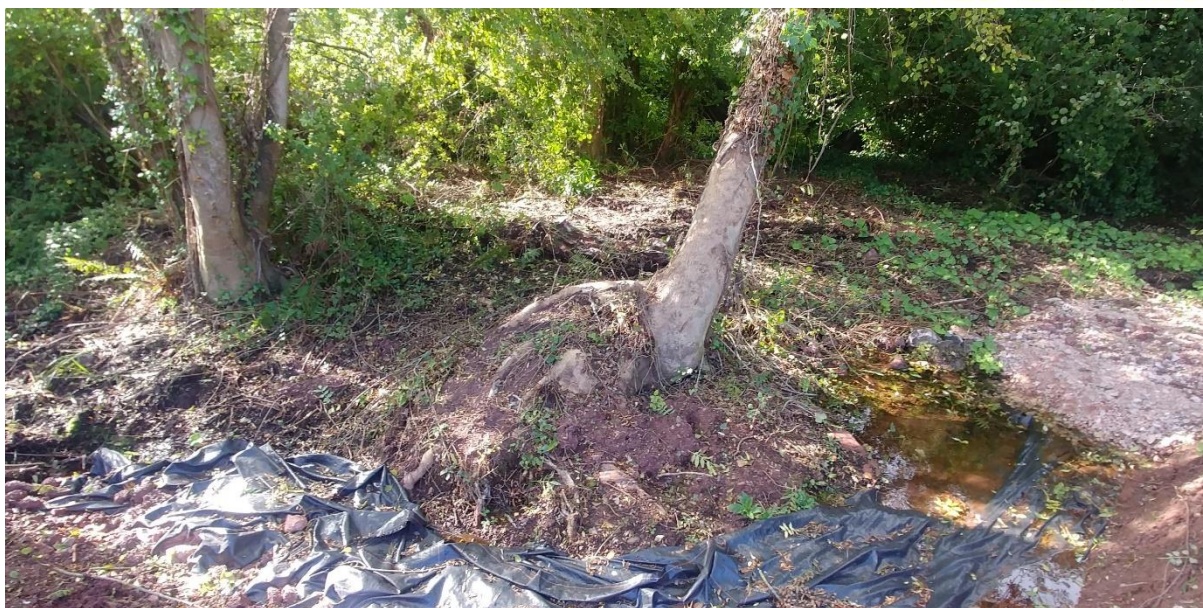
Figure 2 - Tree 4 - the root plate is unstable